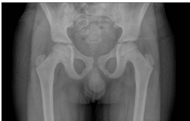
Figure 7. Note the narrow pelvis, hypoplastic pubis and ilium, as well as the short femoral necks (Patient 3)

The mode of inheritance is autosomal recessive in 3M syndrome. CUL7 mutation in 6p21.1. has been found in several families (9,11). Recently, null mutations within the gene OBSL1 have also been reported (12). OBSL1 is a putative cytoskeletal adaptor protein that localizes to the nuclear envelope OBSL1 and it has been proposed that its mutations are causing the primordial growth disorder 3M syndrome (12). However, we were not able to perform genetic analyses in the patients presented in this report.