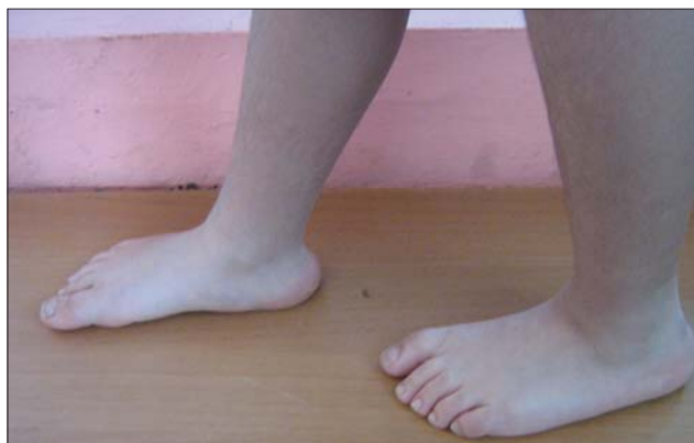
Figure 6. Prominent heels were present in all patients