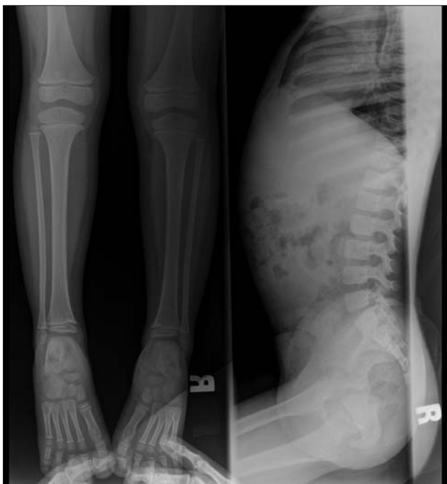
Figure 5. Radiography of the lower extremity and lateral vertebrae in Patient 2

Testicles small for pubertal stage, oligo-azoospermia and hypergonadotropic hypogonadism have been reported in