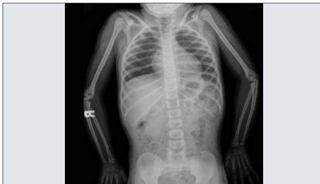
Figure 8. Radiography of the thoracolumbar spine in Patient 4 showing hypoplasia of the 12 th ribs

An early diagnosis is important for genetic counseling in 3M syndrome, especially in countries like Turkey where consanguineous marriages are common and autosomal recessive genetic disorders leading to severe short stature should be kept in mind. 3M syndrome should always be considered in the differential diagnosis of patients with growth retardation of prenatal onset.