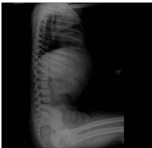
Figure 3. Lateral radiography of the vertebrae showing tall vertebral bodies with reduced anterior-posterior diameters (Patient 1)

IGF-1: insulin-like growth factor-1, IGFBP-3: IGF binding protein-3