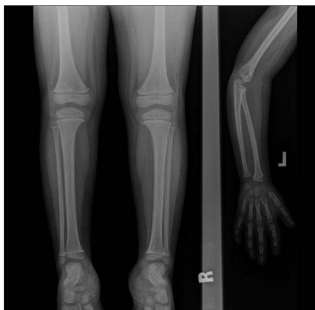
Figure 4. Radiography of the upper and lower extremities showing slender long bones (Patient 1)