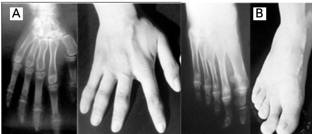
Figure 2. Brachydactyly due to short metacarpal/metatarsal bones and phalanges. Note that the second digits are relatively longer than the others and less involved