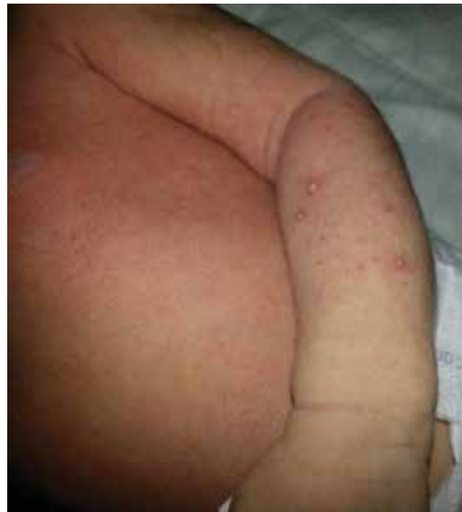
Figure 1. The appearance of the miliaria rubra on the trunk and arm

adrenal insufficiency, the patient was started on hydrocortisone therapy. In blood samples taken before hydrocortisone therapy, plasma adrenocorticotropic hormone level was 5.73 pg/mL, cortisol level 31 ug/dL and 17-hydroxyprogesterone level was 1.87 ng/mL. These findings led us to reconsider our initial diagnosis of CAH. A tentative diagnosis of hypoaldosteronism was considered. The patient's plasma aldosterone was found to be over 6000 pg/mL (normal ranges 50-1750 pg/mL). Plasma renin activity was 100 ng/mL (normal ranges 2-5 ng/mL) and saliva sodium level was 152 mEq/L (normal ranges 33.1±13.4 meq/L) (15). These findings were considered to be consistent with a diagnosis of systemic PHA. The patient is still being monitored in our unit and is continuing to be treated with 0.3 mg/day of fludrocortisone and also receiving treatment for