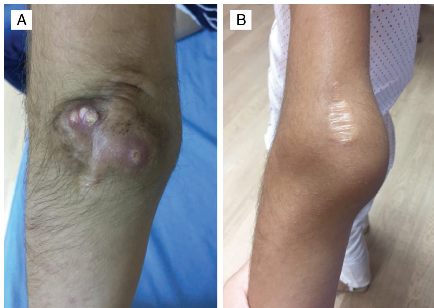
Figure 1. A) Calcinosis in the left elbow of Case 1. B) Subcutaneous mass around the left elbow of Case 2

This nine year-old female patient was simultaneously referred to our department with her older sister, Case 1. She had developed similar but milder complaints over the preceding two years, including swelling of the left elbow which required surgery due to joint contracture and bilateral recurrence in her elbows thereafter. Direct radiographs demonstrated radio-opaque soft tissue masses around both elbows (Figure 2). Dental and ophthalmological examination showed no involvement. Hyperphosphatemia, elevated