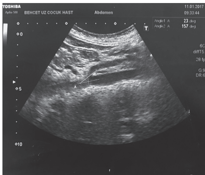
Figure 2. Point-of care ultrasound image of narrowed aortomesenteric angle