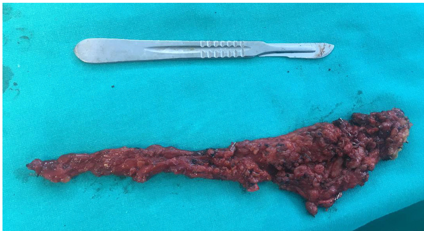
Figure 1. Intraoperative view after a portion of arterial and venous connections of arterio-venous malformation are attached

Chronic leg ulcers may be evaluated as the result of