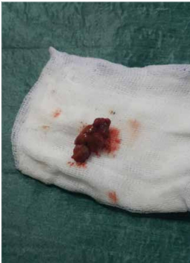
Figure 3. Excised lesion