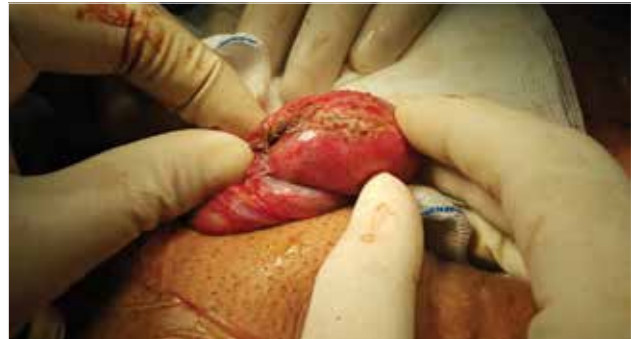
Figure 4. Covered testicular tissue

any complication on the postoperative day 2. The biopsies of the surrounding tissues around the testicle that displayed diffuse necrosis and atrophy were reported to be nonmalignant tissue.