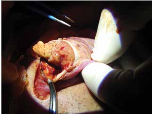
Figure 2. Open lesion