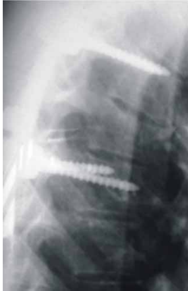
Figure 3: Lateral thoracic radiography: posterior transpedicular stabilization.

The importance of an early diagnosis of thoracic spinal fractures was demonstrated by Reid et al., who showed a ten-fold increase in the incidence of neurological deficit in patients in whom the diagnosis was initially missed. 9 Similarly in our case, the diagnosis was initially missed. Fortunately enough, the patient has arrived to our emergency room just in time, so that right diagnosis was achieved, and a neurological deficit was avoided. The treatment of instable thoracic spine fractures remains controversial despite an increased knowledge of the morphometric, anatomic, and biomechanical features of thoracic vertebrae. 10 There is no consensus regarding optimal treatment and various conservative and operative options have been described in the literature with different inclusion criteria, follow-ups and evaluation tools. 11 Schweighofer et al. briefly described a series of 6 patients with Magerl type B or C lesions in the upper and middle thoracic spine and operated these patients. 12 Similarly, our