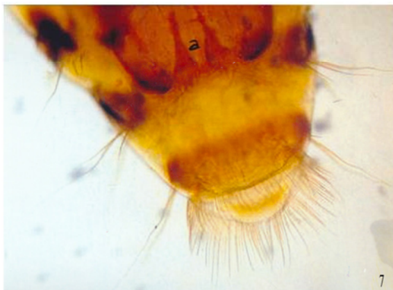
Figure 1. Piagetia titan , female, a. Prosternal plate b. Mesosternal plate c. Metasternal plate;