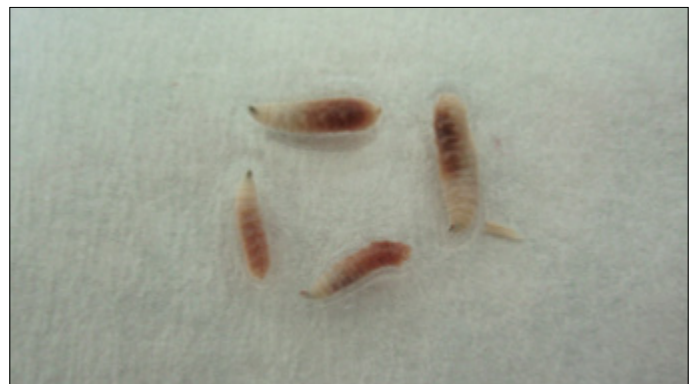
Figure 2. Gross appearance of the parasite