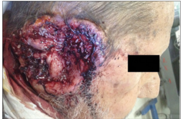
Figure 1. Gross appearance of the tumor (maggots can be seen within the necrotic tissue)

Myiasis is rarely seen in healthy individuals. It is commonly seen in patients with mental retardation or psychiatric disorders, elderly individuals, those with poor self-care and hygiene, and those with immune system disorders (8). In our case, the patient