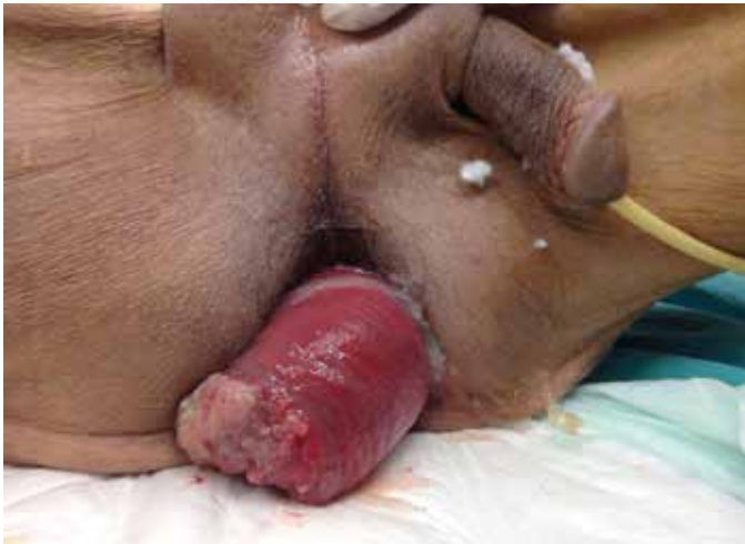
Figure 1. Preoperative appearance of the prolapsed portion of the bowel