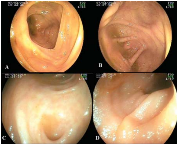
Figure 1. Landmarks for cecal intubation. A: Ileocecal valve, B: Crow's-foot or "Mercedes Benz sign" C: The appendix orifice, D: Intubation of ileum and visualization typical ileum surface-like coral or lambs wool.

had both poor bowel preparation and redundancy and 3 of them had bradycardia resulted in emergent termination of procedure. At 3 patient previous abdominal surgery, poor bowel preparation and intolerance to colonoscopy resulted in a failure at the cecal intubation.