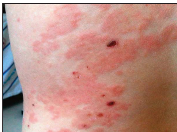
Figure 3. Skin examination of patient showed diffuse urticaria like erythematous plaques blisters on his chest, back and extremities