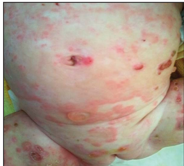
Figure 1. Skin examination of infant showed diffuse erythematous plaques and blisters on her chest, back and extremities

BP as sole agents or in combination with corticosteroid, with variable success [7]. We decided to report these two cases because BP is