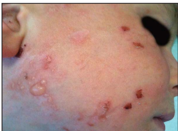
Figure 4. Skin examination of patient showed diffuse urticaria like erythematous plaques blisters on face