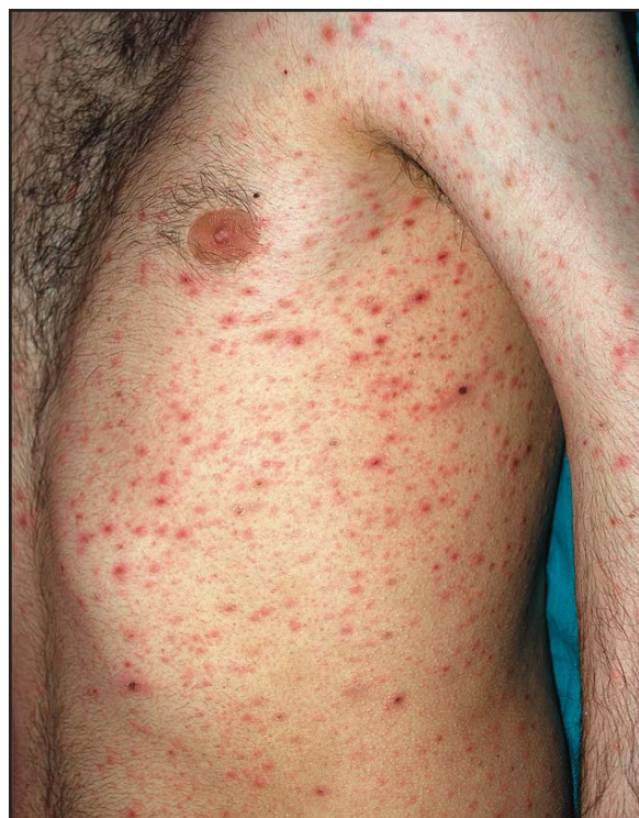
Figure 3. Erythematous, hemorrhagic crusted papules and vesicles on the trunk and arm

Hemogram, routine biochemical parameters, urinary examination, C reactive protein, erythrocyte sedimentation rate were normal. Histopathologic examination of the skin biopsy taken from the trunk of the patient revealed basket orthokeratosis