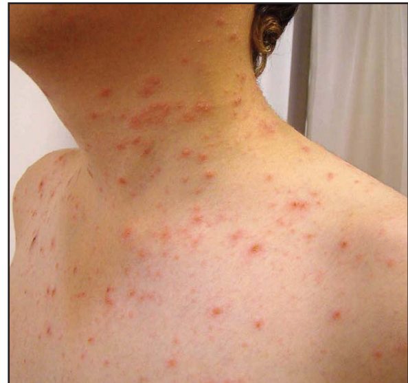
Figure 1. Erythematous papulosquamous lesions, intact vesicular lesions and few ruptured vesicles on the neck and trunk

Fifteen years old male patient was admitted to our clinic with complaint of itching, red rashes and ve-