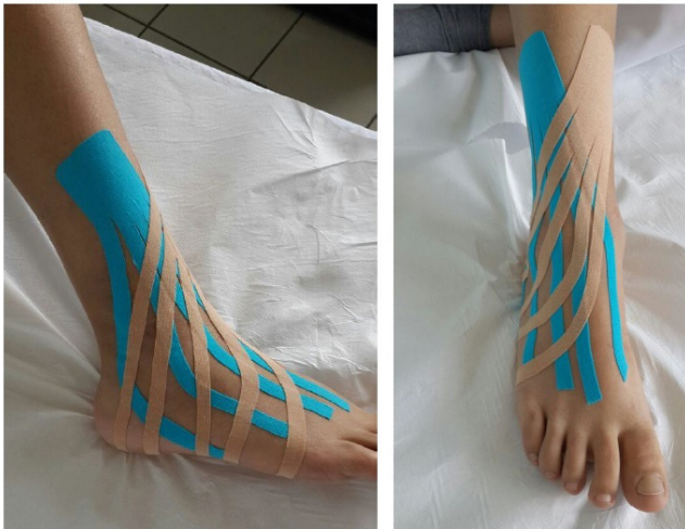
Figure 1. Application of kinesiotaping.

lization with cast, 48 hours since injury occurrence, multiple injuries, have neurologic deficit at lower extremities, chronic instability of ankle, had surgical treatment to ankle, knee and hip.