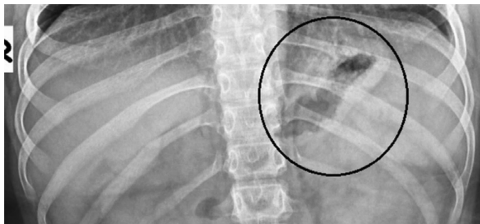
Figure 1. Abdominal plain radiography of the patient shows an opaque area related to gastric wall thickening

Plain radiography showed an irregularly circular opacified area in the left upper quadrant. There is a wide variety of calcifications seen on plain abdominal radiography. Calcifications can be categorized by organ system and location in the abdomen such as calculi of urinary tract, calcifications of digestive tract, liver and gall bladder, peritoneal and surrenal region calcifications, phleboliths, appendicoliths, vascular calcifications, etc. 5,6 Radiology department stated that there was an opaque area