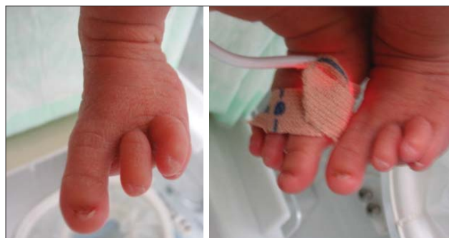
Figure 4. Ectrodactyly deformity of the feet in case 2