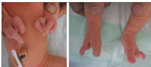
Figure 2. Ectrodactyly deformity of hands and feet of case 1