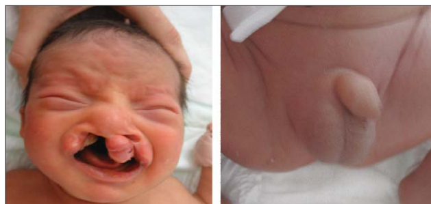
Figure 3. Bilateral cleft lip and plate, hypertelorism, micropenis and cryptorchidism of case 2