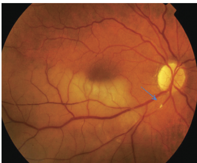
Figure 1. Color fundus photograph of the right eye demonstrating the transluminal calcific embolus (arrow), narrowed arterioles and retinal opacification

After obtaining an informed consent for TYE for BRAO, the right eye was anesthetized with topical drops. A Goldmann fundus contact lens (Ocular Instruments, Bellevue, WA) was used to focus the Nd:YAG laser (Coherent 7970, Palo Alto, CA) on the embolus within the retinal artery. A 2.0 mJ pulse was initially delivered directly to the embolus which yielded no retinal tissue response. The energy was increased in 2-mJ increments without tissue response until the setting was placed at 6.0 mJ for embolysis. Although the laser energy was applied for embolysis, a small opening was made in the arteriolar wall at the same time and just after the laser application with 6.0-mJ, suddenly subhyaloid hemorrhage developed overlying the occluded vessel area (Figure 2). During the embolysis and opening the arteriolar wall, some part of the embolus could have been passed into the