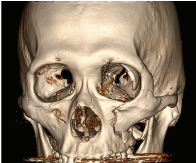
Figure 1. Computed tomography of the skull and face. Left tripod fracture is evidenced by cracks over zygomatic arch, lateral and inferior orbital wall. The large plate of Baerveldt glaucoma implant and the small ring-shaped Ahmed glaucoma valve implant could be seen respectively over left and right orbit