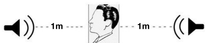
Figure 1. Measurement setup

For each subject, the pure tone thresholds were measured in free field for 500, 1000, 2000, and 4000 Hz, and the pure tone averages