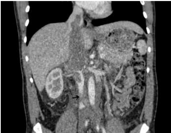
Figure 1. Tomographic examination indicating thrombosis in vena cava inferior

After uneventful postoperative period, histopathologic examination indicated pure embryonal carcinoma (Figure