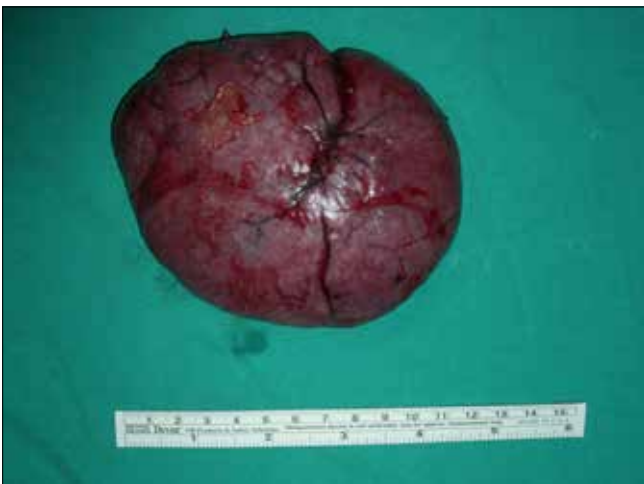
Figure 2. 100 mm phyllodes tumor excised from the left breast