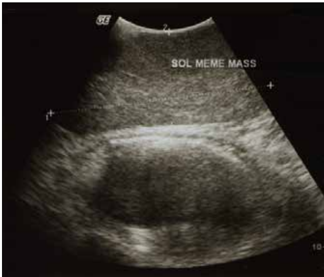
Figure 1. Ultrasonography in October 2007 showed a regular-shaped hypoechoic mass measuring 100 × 43 mm in diameter