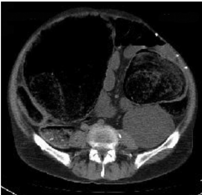
Figure 1. An axial CT section showing well-formed, large faecal ball in dilated sigmoid colon

The patient's previous medical history included colonic surgery of uncertain aetiology 9 years earlier. During the physical examination, the abdomen was markedly distended. A digital rectal examination revealed empty ampulla recti. Plain abdominal X-rays showed marked distension of the entire colon, which was full of faecal waste. In addition, computed tomography (CT) of the abdomen revealed markedly distended colonic segments filled with intraluminal faecal matter (Figure 1). The patient was admitted in the surgical intensive care unit of our hospital, and surgical intensive care team began rapid intravenous fluids and electrolyte replacement. A nasogastric tube was inserted and a large volume of liquid faecaloid content was emptied. Initially, we tried medical strategy, including enemas, but it was not effective in resolving mechanical ileus. Since our patient was unresponsive to conventional medical treatment for about 1 week and his abdomen was severely distended, leading to abdominal compartment syndrome, we agreed to perform a surgical intervention with a preliminary diagnosis of obstructive left colonic malignancy.