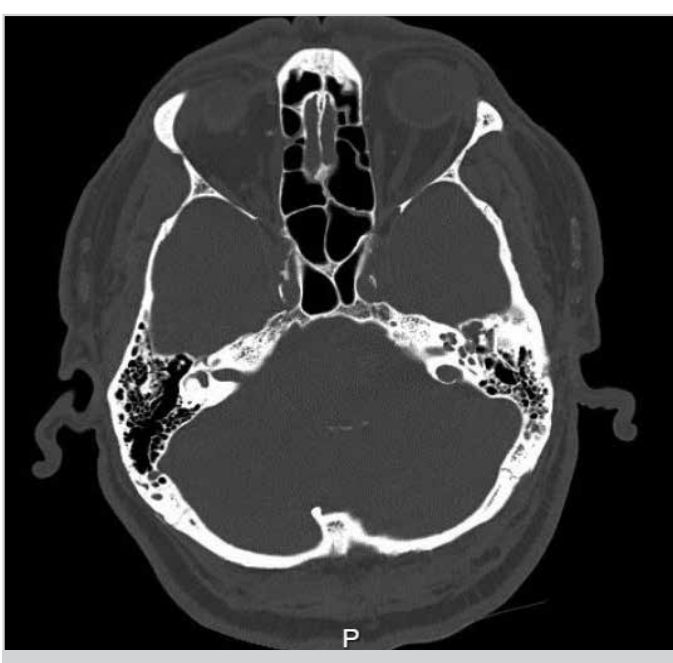
Figure 1. Computed tomography view of the patient with left malignant otitis externa