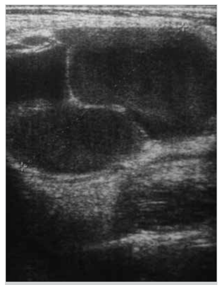
Figure 2. Ultrasound scan showing a 55×40×35 mm, multilobulated, homogenous, cystic mass on posterolateral border of sternocleidomastoid (SCM) muscle in the right supraclavicular region