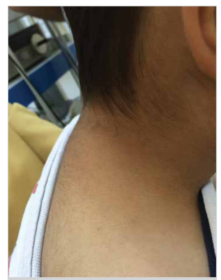
Figure 4. Physical examination at the third postoperative month revealing no recurrence

der by the family. Neither pain nor movement restriction was stated. His physical examination revealed a well-circumscribed, multilobulated, 5×3 cm, immobile, non-tender, non-pulsatile, fluctuating, cystic mass in right posterior cervical and supraclavicular region (Figure 1). The mass was evaluated with US and MRI scans. The US scan revealed a 55×40×35 mm, multiloculated, homogenous, cyctic mass on posterolateral border of the sternocleidomastoid (SCM) muscle in the right supraclavicular region (Figure 2), whereas the MRI scan showed a 63×52×40 mm, well-circumscribed, septated, cystic mass in the lateral border of SCM muscle superior to the clavicle and anterior to supraspinatus muscle suggesting a hemorrhagic LM (Figure 3).