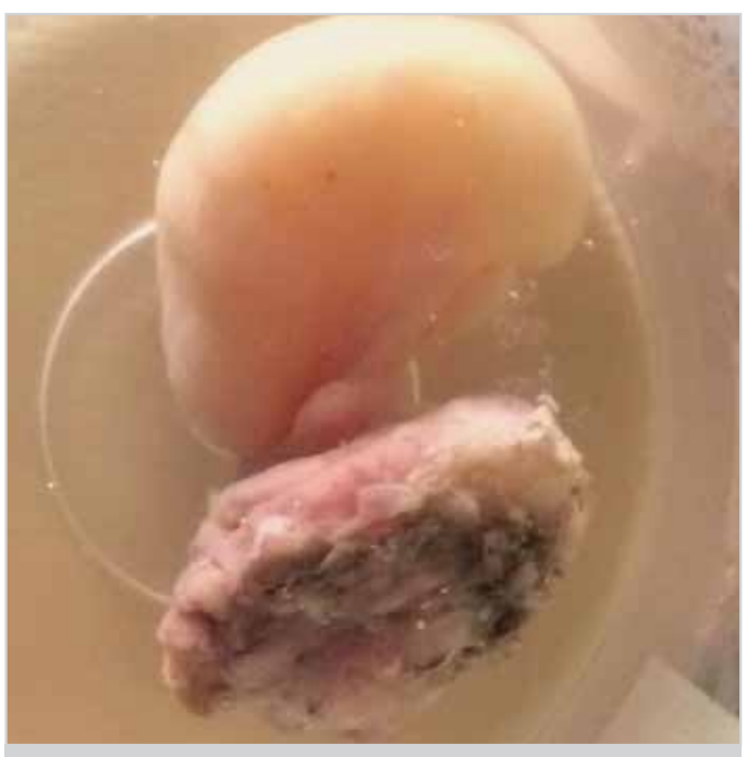
Figure 3. Surgical specimen of left tonsillectomy, including the polypoid mass, just after fixation