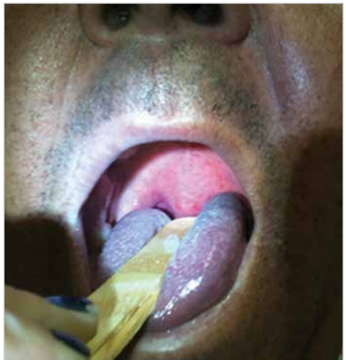
Figure 2. Follow-up examination demonstrating a small vesicular lesion in the base of the uvula; the bullous lesion was absent after 3 days of the initial symptoms