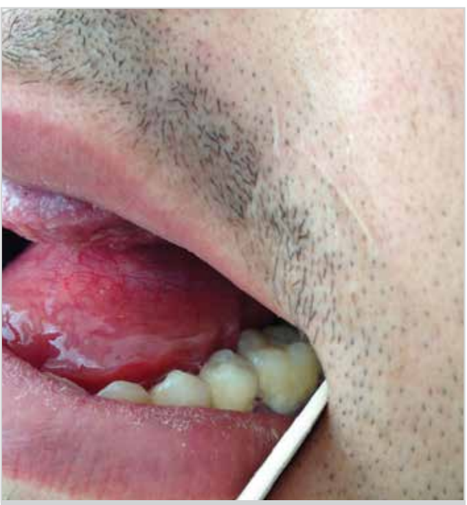
Figure 1. Appearance of the ranula in oral examination

Depending on the location, many lesions should be considered in the differential diagnosis. Diseases, such as branchial cleft cysts, dermoid cysts, abscesses, cystic hygroma, laryngocele, lymphadenopathy, thyroglossal duct cyst, and salivary gland