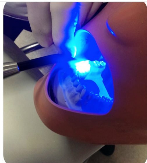
Figure 2. Restorations were performed on a dental phantom head to mimic the oral environment