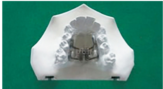
Figure 2. Hybrid expander rapid maxillary expansion appliance

After the segmentation of the 1 st premolar, 2 nd premolar and the 1 st molar teeth, they were isolated by splitting the surrounding structures (Figure 3). The volumetric measurements of the isolated teeth were made and changes occurring at the beginning and after the retention were recorded (Figure 4). Percentage changes of the teeth volumes were also recorded by calculating the ratio as T0-T1 (change in volume) / T0 (initial volume).