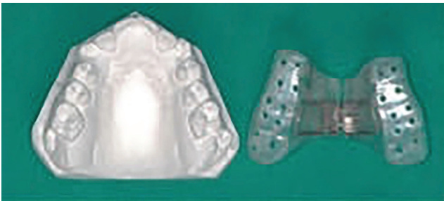
Figure 1. Modified acrylic cap splint rapid maxillary expansion appliance

Rochester, NY) and at the following settings: 8.0 mA and 70 kV for 6.15 seconds, 0.18 mm axial slice thickness. CBCT records of the patients were configured as 3D after being transferred to Mimics Innovation Suite (Version 10.01 Materialise, Leuven, Belgium). First, the density settings were applied for the transferred images. The most appropriate density ranges for the segmentation of the teeth were decided for each patient. CBCT records, taken in the beginning of the treatment and 3 months after the retention period, of each patient were segmented in the same density setting. On these 3D images, permanent first molars and first and second premolars were segmented.