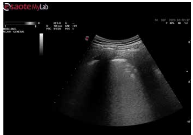
Figure 5. Lung ultrasound shows small subpleural consolidation