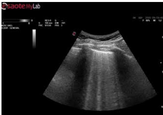
Figure 3. Lung ultrasound shows multiple B-lines

The significance of lung imaging in areas affected by the COVID-19 outbreak was reported by Ai et al. (21). stating that 60-93% of patients had positive thorax CT findings consistent with COVID-19 before RT - PCR results turn positive. In a study by Kalafat et al. (22), they found positive LUS findings consistent with COVID-19 pneumonia in a woman who initially had a negative RT-PCR result. They reported that the patient, whose RT-PCR tests were negative