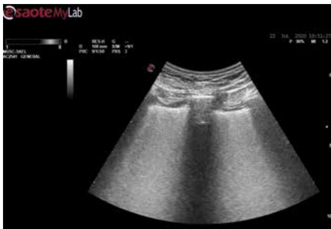
Figure 4. Lung ultrasound shows confluent B-lines