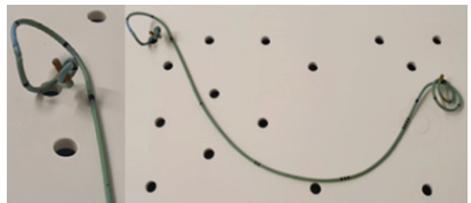
Figure 2. Left ureteric stent demonstrating knot formation in the proximal J-coil with residual encrustation following lithotripsy and extraction. Significantly more encrustations were observed during ureteroscopy around the knot, which increased its diameter and prevented extraction and passage at the vesicoureteric junction

2). Careful laser lithotripsy of the encrustation/debris reduced the diameter, increased the mobility of the distal knot and facilitated stent extraction with gentle traction. No contrast extravasation was identified on completion RGP to suggest