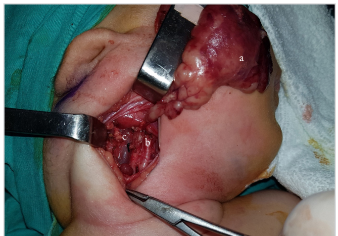
Figure 3. Excision of the solid mass; view highlighting its vicinity to major vasculature. a. solid mass, b. carotid artery, c. internal jugular vein