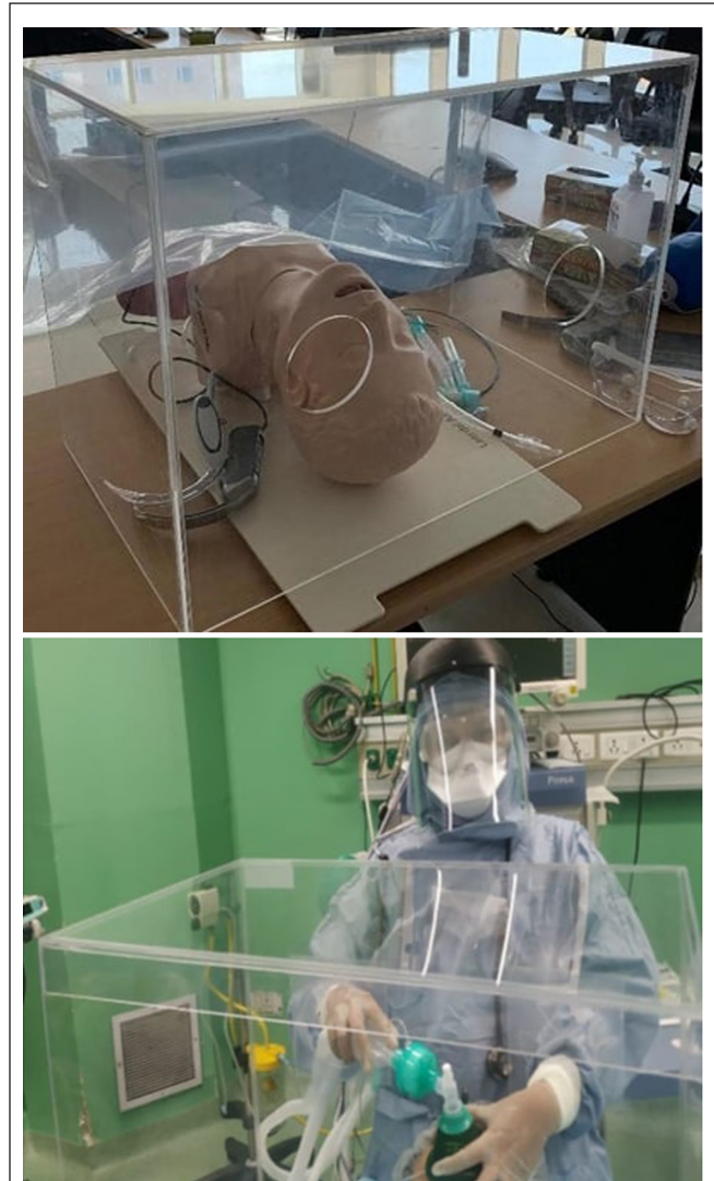
Figure 1. Intubation box used in our study.

The patients were randomly allocated to 2 groups by computer-generated random numbers, depending upon whether a C-MAC VL (Karl Storz, Tuttlingen, Germany) was used (group C, n=30) or McGrath VL (Aircraft Medical Ltd,