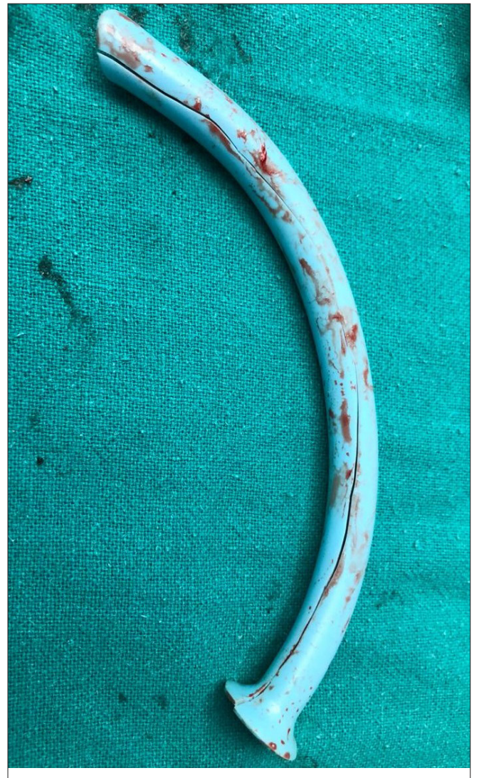
Figure 1. A nasopharyngeal airway with a longitudinal slit

trauma/bleeding in addition to associated increased work of breathing, hypoxemia, and death. This complication can be reduced by choosing an appropriately sized NPA and securing it in a position to prevent dislodging. It has been suggested to use either a safety pin inserted through the NPA flange or a 15-mm tracheal tube connector placed into the proximal part of the NPA, or tapes can be attached to the flange to prevent its distal migration (2).