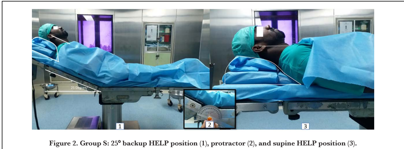
Figure 2. Group S: 25° backup HELP position (1), protractor (2), and supine HELP position (3).