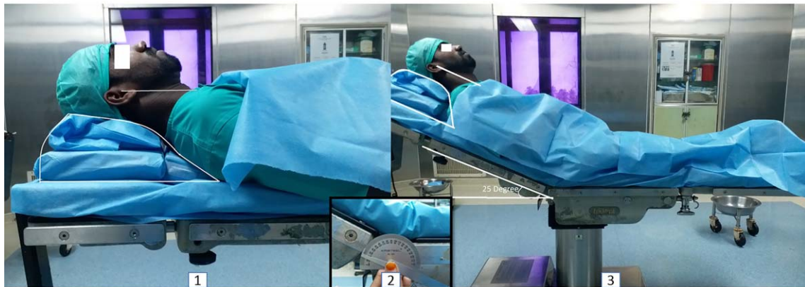
Figure 1. Group B: supine HELP position (1), protractor (2), and 25° backup HELP position (3).

torso at the hips may improve the line of sight for the anaesthesiologist. In this position, less force is required to elevate and move the tongue and other tissues out of the line of sight. This position avoids stooping by the anaesthesiologist to acquire a view of the larynx. 1 The 25° backup position also reduced the need for laryngeal manipulation and the time taken for intubation. 9 The previous studies either did not apply for HELP or were conducted on mannequins/two different sets of patients. Thus, we designed this study to compare the glottic view in a HELP with supine or 25° backup position.