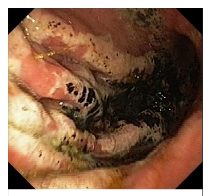
Figure 2. Ulcero-necrotic corrosive gastritis in the large corpus curvature of the stomach

tion in the intensive care unit. In the oesophago-gastro-duodenoscopic examination, the oesophageal mucosa and lumen appeared to be normal, however, starting from the entrance to the stomach, necrosis was observed in the centre of the ulcerations and the corpus major curvature, which were thickened locally. Necrotic corrosive gastritis was identified in the corpus (Figure 1 and 2). The patient was given oral regimen 1 (water), hydrotalcide (3 g day<sup>-1</sup>), sucralfate suspension (12 g day<sup>-1</sup>), misoprostol (600 µg day<sup>-1</sup>), N-acetylcysteine (1.800 mg day<sup>-1</sup>), ranitidine (75 mg day<sup>-1</sup>) and pantoprazole (80 mg day<sup>-1</sup>), ceftriaxone (2 g day<sup>-1</sup>) and methylprednisolone (40 mg day<sup>-1</sup>),