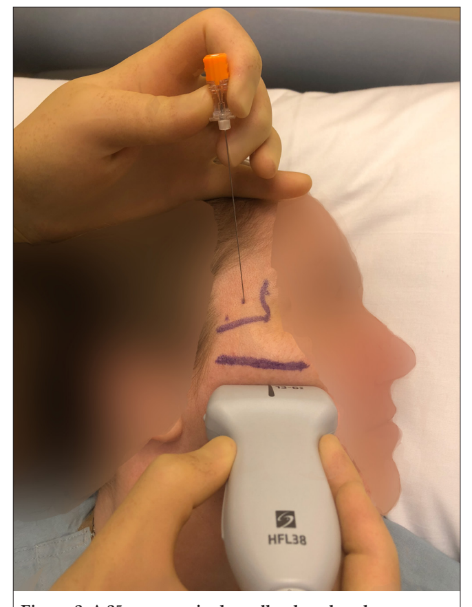
Figure 3. A 25-gauge spinal needle placed at the needle insertion site and advanced using an out-of-plane technique into the pterygopalatine fossa via a 13-6 MHz Sonosite HFL38 linear ultrasound probe