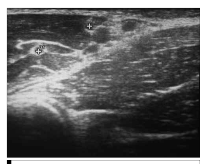
Figure 1. Ultrasonic view of axilla in the proximal position. The median and musculocutaneous nerves were marked

Data was analysed with IBM Statistical Package for Social Sciences Statistics 20 software (IBM SPSS Statistics; Armonk, NY, USA). The normality of distribution for the variables was tested with the Kolmogorov-Smirnov test. Comparison of dependent groups was made with the repeated measures ANOVA test. Homogeneous groups were compared with the Bonferroni test. Correlation between variables was evaluated with Pearson's correlation test. Comparison of two indepen-