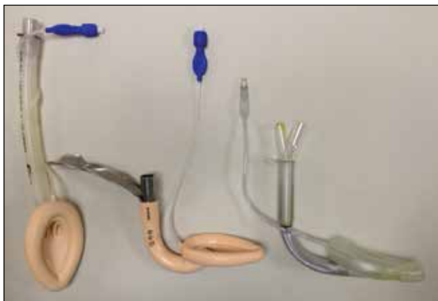
Figure 1. LMA Classic (# 5), LMA Fastrach (# 4) and LMA Supreme (# 5)

fiberoptic assistance (4, 5). It has a rigid handle that allows one-handed insertion, removal or adjustment (Figure 1).