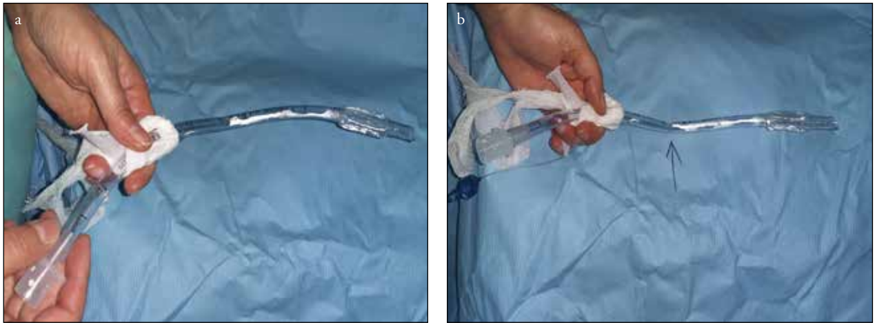
Figure 1. a, b. Kinked ETT from different views

Polyvinyl ETTs are relatively resistant to kinking at room temperatures. However, at body temperatures, the tubes soften and may kink causing lumen occlusion even at very low angles (3). The exit point of the cuff line to the pilot balloon is often reported as the location of kinking (3). Head position other than neutral position (4) or shifting the position of the ETT (5)