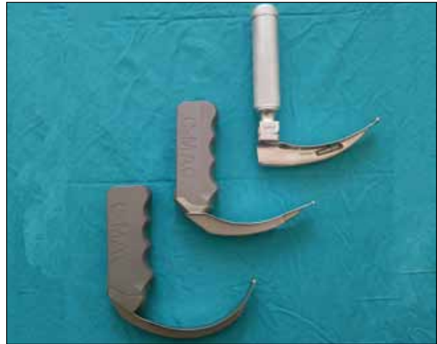
Figure 1. From left to right: (a) C-MAC D-Blade videolaryngoscope (b) Conventional C-MAC videolaryngoscope, (3) Macintosh laryngoscope

All anaesthetists were briefed about the study. Before starting the trial, a 30-minute standard education session was provided for all of the participants by one instructor. The education started with the screening of a computer-based presentation about the use of indirect laryngoscopes, which lasted 5 minutes. Consequently, each participant was permitted to attempt five intubations on the SimMan manikin (Laerdal Medical), on which the study was performed. The instructor provided constructive feedback. No presentation or demonstration was performed about the Macintosh, but five attempts at intubation were permitted.