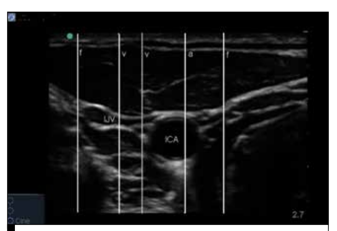
Figure 2. Ultrasound image showing normal left internal jugular vein anatomy in healthy volunteer. Line positions reflect: f=Fail, a=Fail, v=Pass, ICA Internal Carotid Artery, IJV, Internal Jugular Vein

The success rate for locating the right IJV was 88% (n=26, 23/26) in the senior and 68.4% (n=19, 13/19) in the junior group (p<0.001). The success rate for locating the left IJV was 69% (18/26) in the senior and 78% (15/19) in the junior group, and this difference was found to be significant (p<0.001). Whereas the difference in success