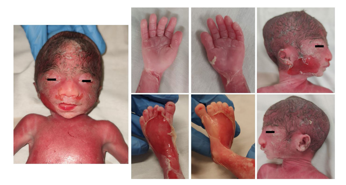
Figure 2. Clinical findings of the exitus fetus were a prominent forehead, biparietal narrowing, hypertelorism, flat and wide nasal bridge, broad thumbs in the hands and feet, and preaxial polydactyly in the foot.

asymptomatic bifid epiglottis, imperforate anus, and hypothalamic hamartoma), evaluation of the individual's genetic and phenotypic characteristics pattern is essential (6). Fortunately, genetic and phenotypic correlations are well documented and can be used to diagnose each condition more accurately (5,7,8). Similar to the present case, large deletions of the GLI3 gene are more commonly associated with GCPS than with Pallister Hall syndrome.