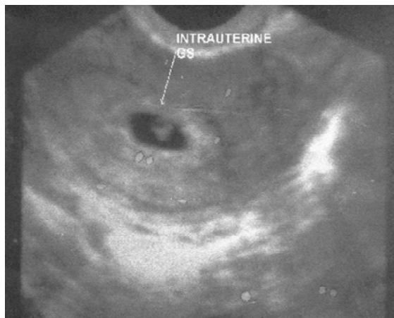
Figure 2: Intrauterine gestational sac after curettage of the intracervical canal.

day with no vaginal bleeding. Pregnancy was continued up to 36 weeks of gestation and alive baby was born.