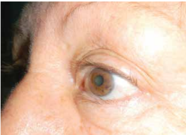
Figure 3. Preoperative appearance of patient with marginal entropion

A thorough examination is crucial for the proper diagnosis and treatment of patients presenting with irritation resulting from contact between the lower eyelashes and the globe. Eyelash contact with the globe may be caused by trichiasis, metaplastic lashes, distichiasis or entropion. As these conditions