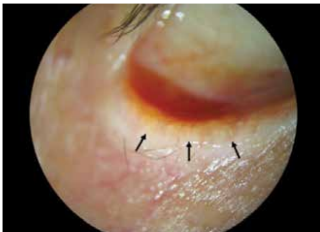
Figure 2. A patient with eyelash loss due to chronic blepharitis. The mucocutaneous junction has anteriorized beyond the meibomian gland orifices, and has reached the base of the eyelash follicles. The arrows indicate the mucocutaneous junction (Lower eyelid has been manually inverted to provide a better image of the mucocutaneous junction)