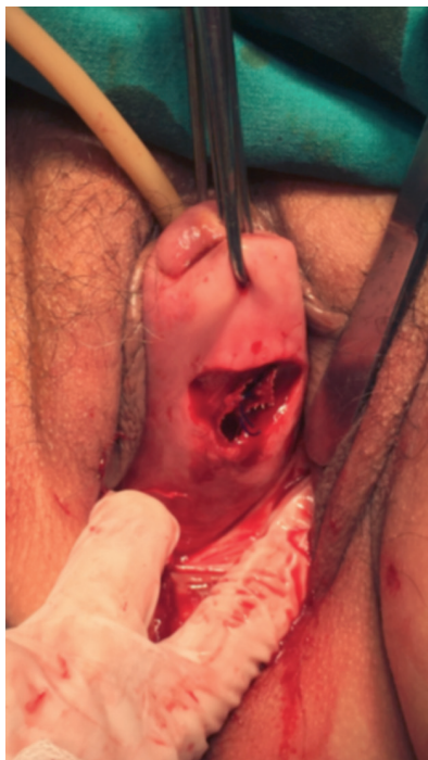
Figure 2. Cervical incision performed on the posterior wall where curved ring forceps are introduced and later mesh is fixed by 2-0 non-absorbable sutures x4

sutures via the vaginal route (Figure 2). The vaginal incision was closed by absorbable sutures.