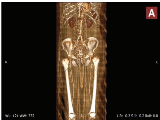
Figure 1. Computed tomography (CT) angiographic view of nearly occlusion in bilateral main iliac arteries at level of aortic bifurcation.