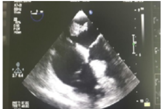
Figure 1: Echocardiographic imagine of myxoma

cardiac angiography was done and myxoma surgery with simultaneous coroner artery surgery was decided in 2 cases (6.6%). There was no specific characteristic in family history. During physical examination, to define myxoma location, generally auscultation findings due to mitral stenosis were indicated left atrial myxoma, whereas findings of right cardiac insufficiency indicated right atrial myxoma.