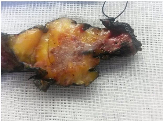
Figure 1. Macroscopic view of the mass. Lesion area with partially lobular margin, mucinous bright surface and small cystic structures

The most important finding of mammography has been reported as microcalcifications (clustered round calcifications)